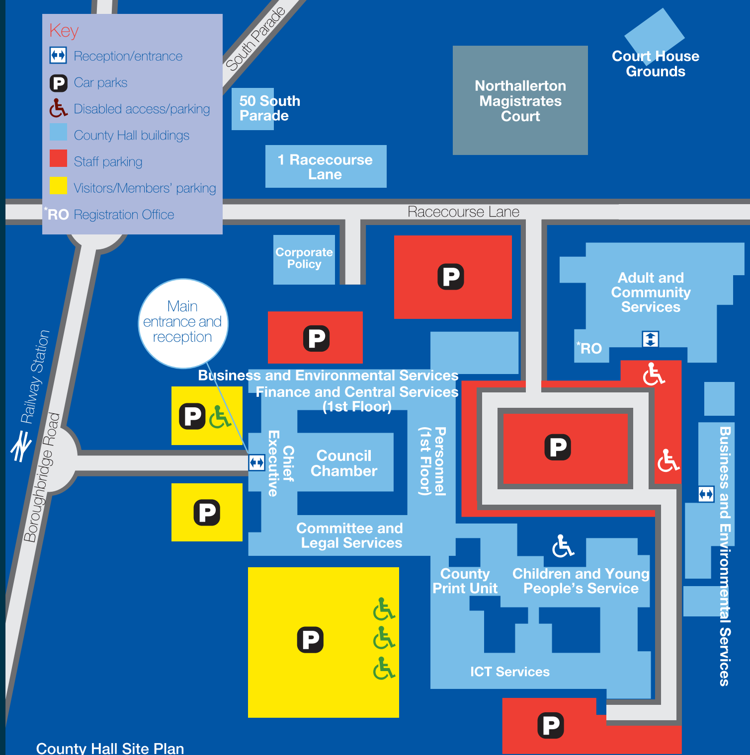
County Hall Site Plan